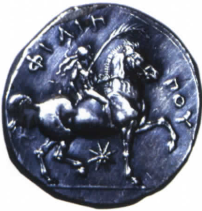
Coins in ancient Greece often had portraits of important leaders on them. This coin shows King Philip on horseback.

In 334 B.C.E., Alexander invaded Asia Minor with a united Greek and Macedonian army. Alexander planned to use terror and kindness to conquer an empire. The towns and cities that resisted him would be burned to the ground and their people sold into