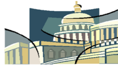
Organized Central Governments